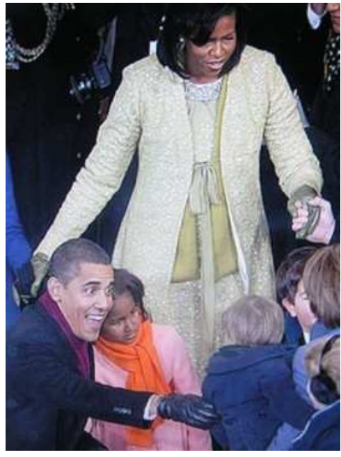
Hey kids, when you grow up, you, too, can join MarathonMasters!